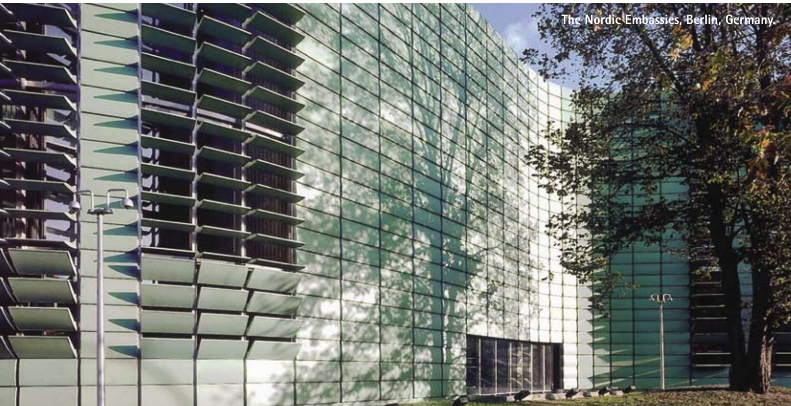
The Nordic Embassies, Berlin, Germany.